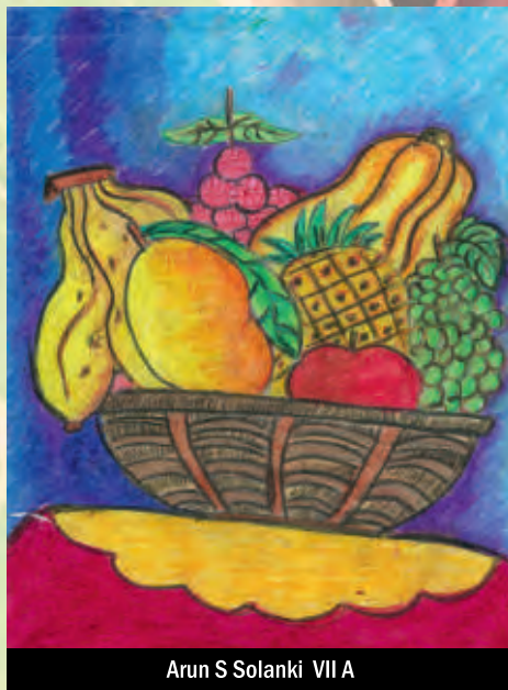
Arun S Solanki VII A