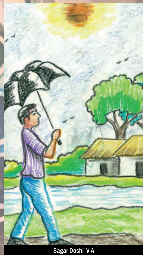
Sagar Doshi V A