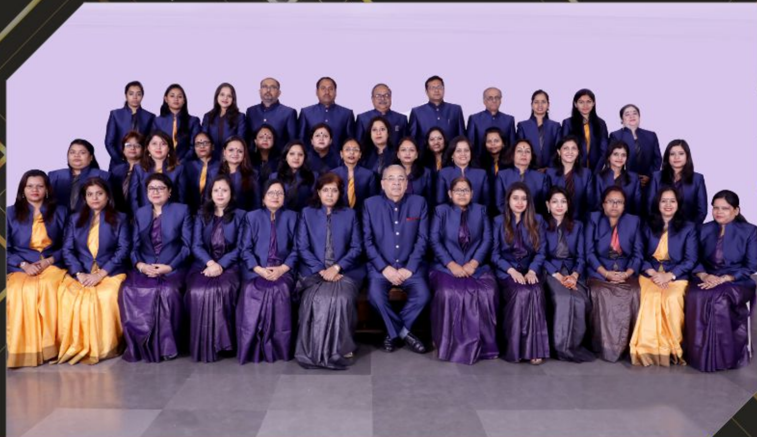
All Teachers - BGES School