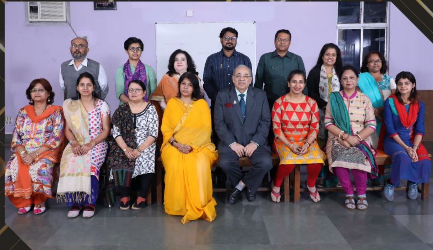
Class X Teachers - BGES School