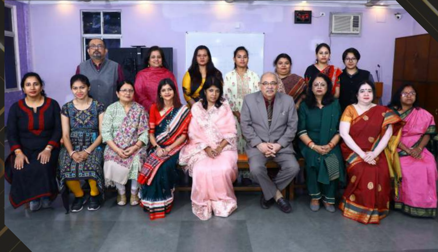
Class X Teachers - The BGES School (ICSE)