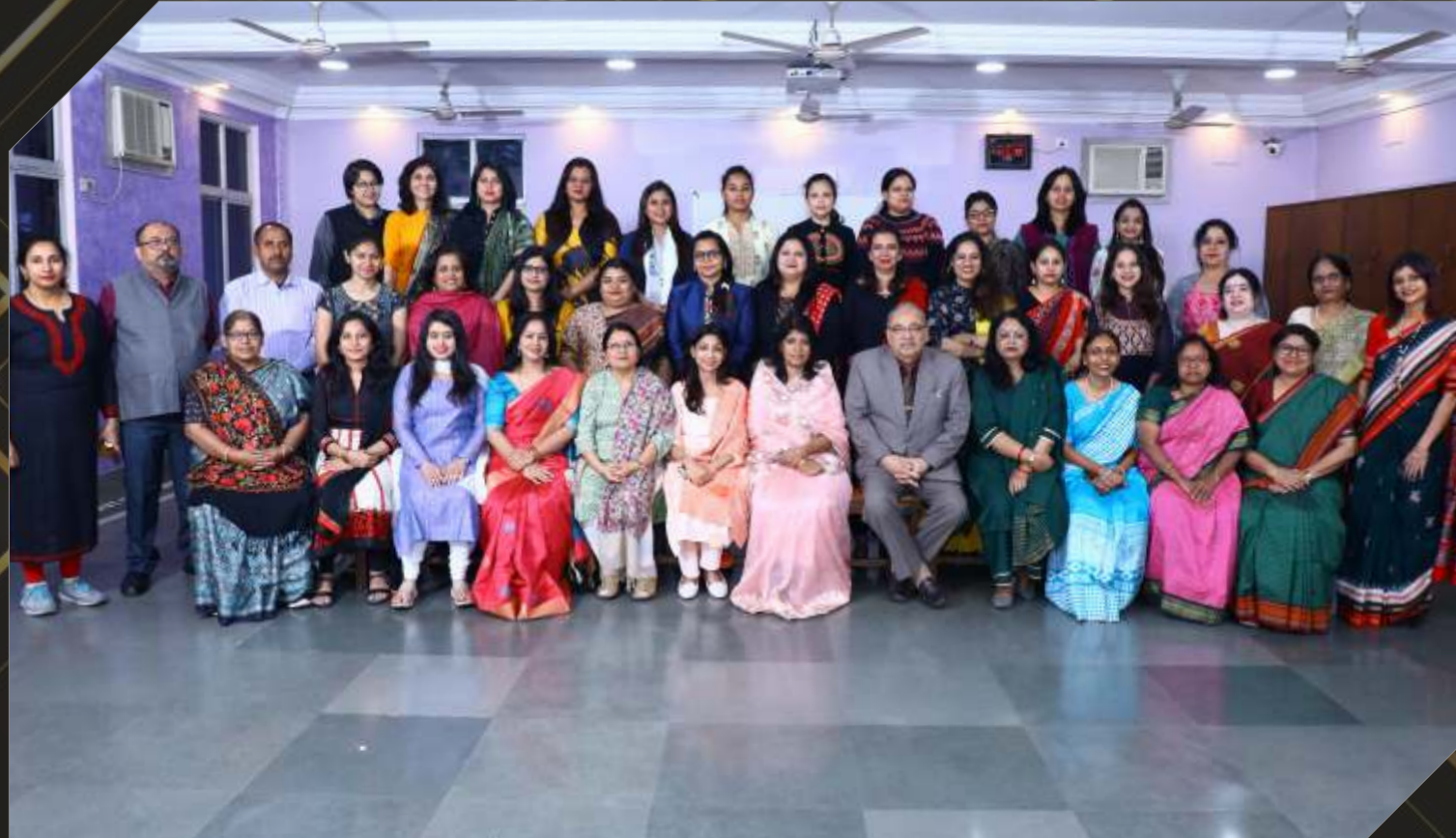
All Teachers - The BGES School (ICSE)